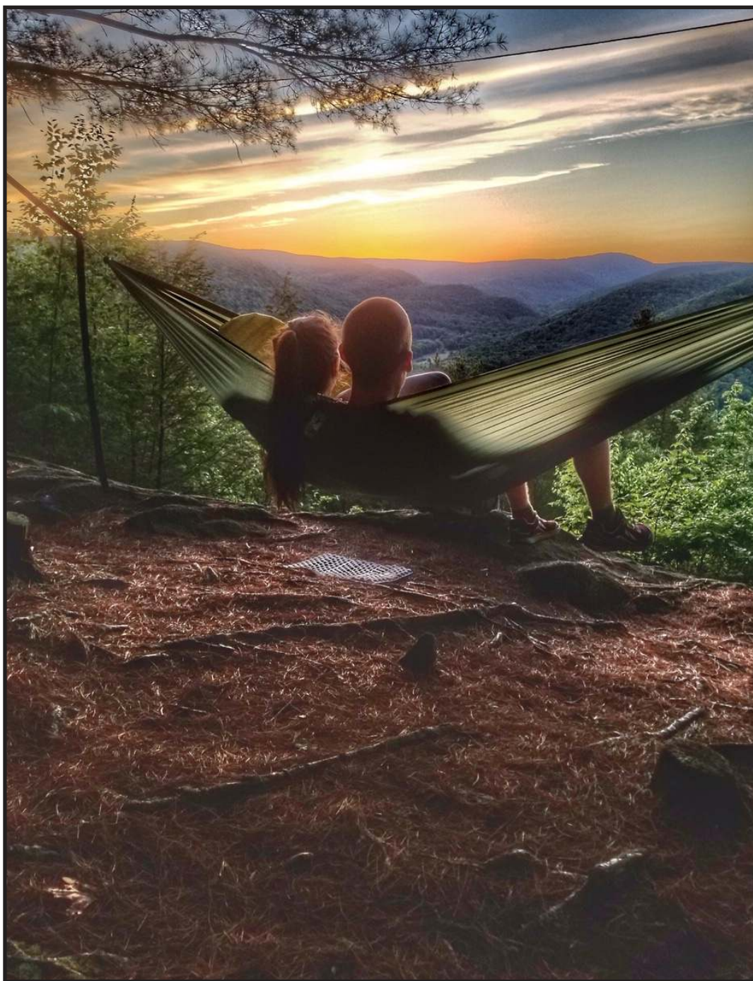
" The Vista on the Newman Marsh Trail"