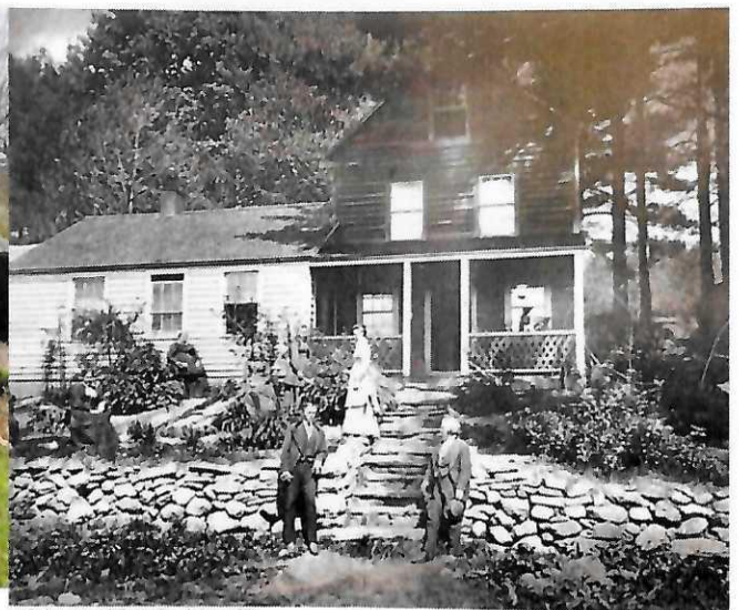
family homestead (Curtis Road circa 1871)

visit our website for more info and registration