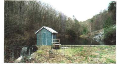
Austin Brook Reservoir

Of note, the 4 th quarter of 2024 was the first time in many years that Chester did not have a DBP violation- an indication that the actions that have been, and will continue to be, taken are having a positive effect on Chester water quality.